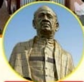
Statue of Unity