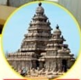
Mahabalipuram Shore Temple